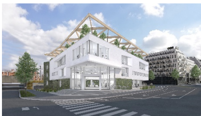
Rendering of CAPE 10 in Vienna's tenth district.